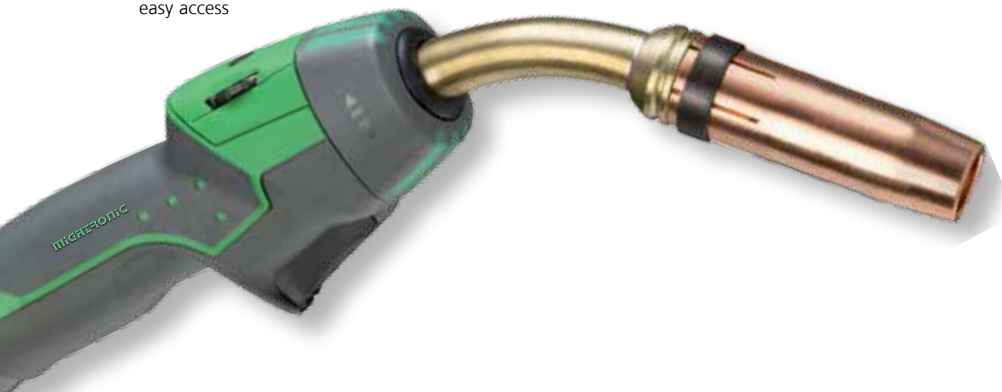
Ergonomic torches for easy access

MIG brazing maintains the strength of the steel and protects the anti-corrosive zinc surface