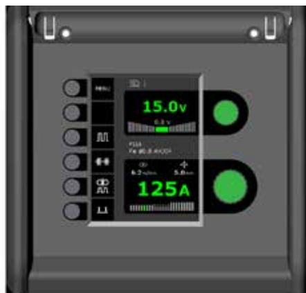
Flex² 3000 control panel - switch on, press and weld