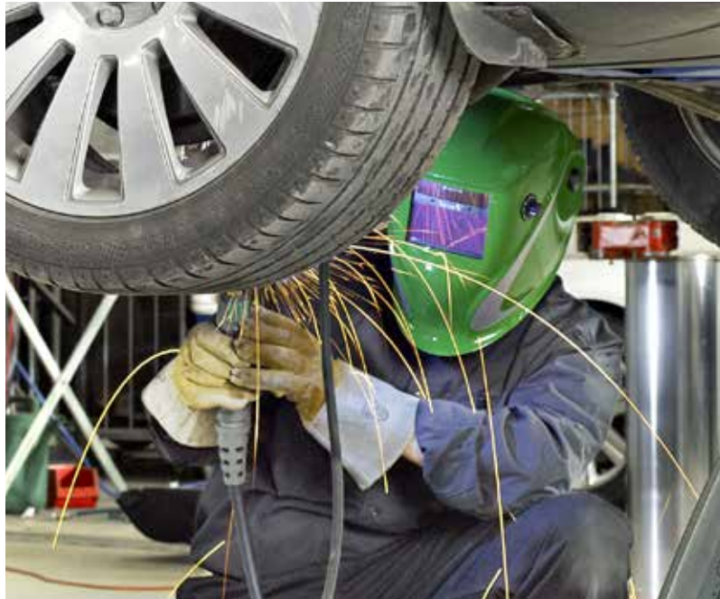
MJCT™ allows saving of up to 200 individual welding jobs

Intelligent Gas Control IGC® is an optional feature in Flex 2 3000; a dynamic gas control that monitors consumption and optimises gas protection. IGC® gives up to 50% gas savings with proportionally fewer replacements of gas cylinder to the benefit of economy, environment and efficiency; especially in the auto business which is characterised by many small welds and tack-welds.